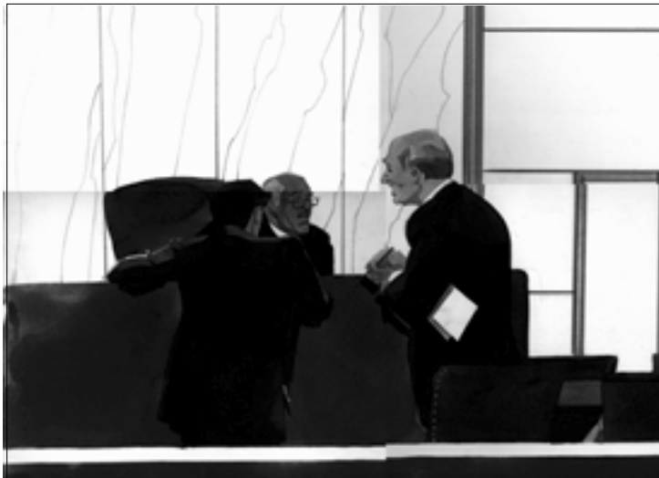
Attorneys meet the judge at the bench for a sidebar

Closing arguments and instructions. After the evidence has been presented, the lawyers make their closing arguments to the jury, concluding the presentation of their cases. Like the opening statements, the closing arguments don't present evidence but summarize the most important features of each side's case. Following the closing arguments, the judge gives instructions to the jury, explaining the relevant law, how