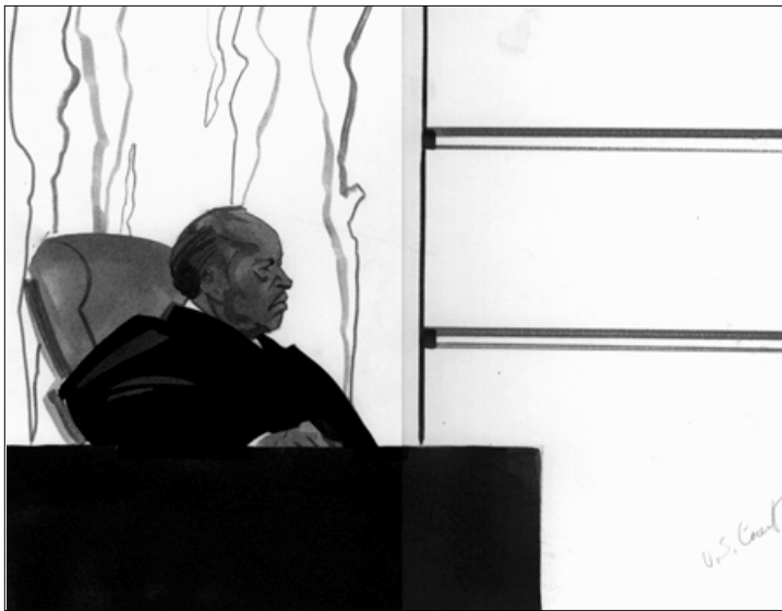
A federal judge presiding over a trial

The Constitution includes both of these protections—life tenure and unreduced salary—so that federal judges will not fear losing their jobs or having their pay cut if they make an unpopular decision. Sometimes the courts decide that a law that has been passed by Congress and signed by the President, or a law that has been passed by a state, violates the Constitution and should not be enforced. For example, the Supreme Court's decision in Brown v. Board of Education in 1954 declared racial segregation in public schools to be unconstitutional. This decision was not popular with large segments of society when it was handed down. Some members of Congress even wanted to replace the judges who